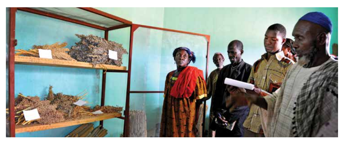
Farmers consult together to select and save a diverse variety of seeds in the banks

Through the EBA, the World Bank reduces farmers' role to that of seed consumers and confines policymaking to the privatization of seed systems. Yet there are many ways governments can support the participation of farmers in breeding and distributing beneficial varieties. The World Bank continues to ignore the calls of a wide range of experts and institutions for bottom-up seed solutions benefiting the poorest<sup>132</sup> and remains entrenched in the defense of corporate interests. This not only jeopardizes the culture and livelihoods of farmers in developing countries, but also contradicts the primordial wisdom, which, for millennia, has pushed humans to nurture, improve, and exchange the earth's rich resources.