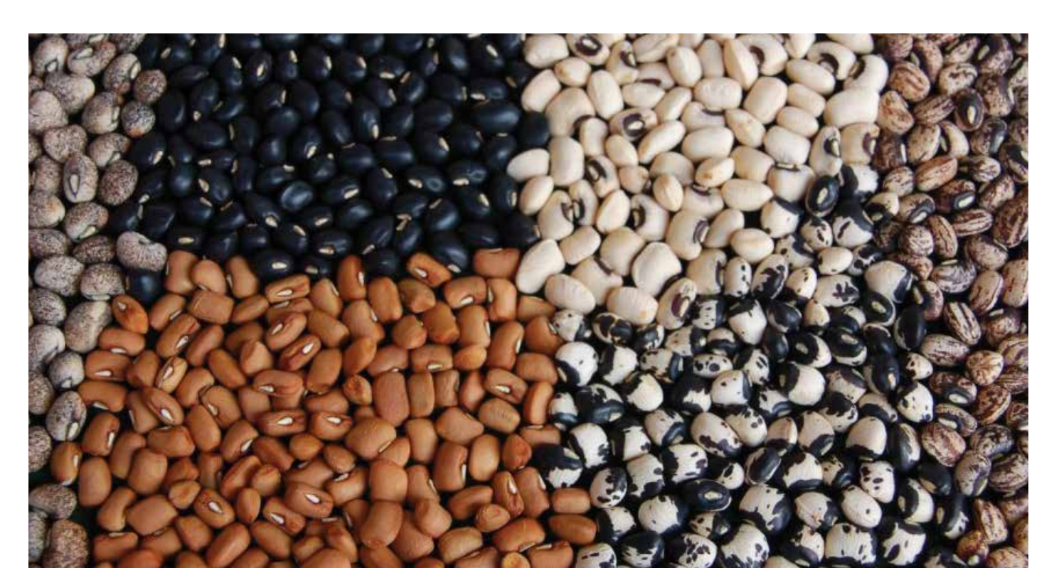
Cowpea seeds germplasm on display at IITA's genebank

However, there is no conclusive evidence that IPR laws will significantly increase private investments in plant breeding in developing countries.<sup>56</sup> In addition, the EBA upholds UPOV membership as a regulatory paradigm, at the expense of sui generis legislation that may be better adapted to local needs. For instance, the 2016 EBA report praises Tanzania for becoming "bound by the 1991 UPOV Act in November 2015," even though it already had a PVP law in place.57 The Tanzanian PVP legislation stipulates that farmers can be charged under criminal law - they risk fines and imprisonment - for using and exchanging protected seeds without the breeder's authorization.58 The use of noncertified seeds is also prohibited in Tanzania's official rice irrigation schemes.<sup>59</sup> Recently, the World Bank indicated that both Vietnam60 and Rwanda have used the EBA to design their new seed ordinances. 61 In Rwanda, the new law establishing PVP regulations conforms to the UPOV Convention (see Box 3).62