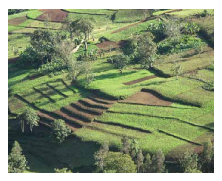
In Ethiopia's Gamo Highlands, traditional agriculture practices preserve high levels of agrobiodiversity

This carefully cultivated agrobiodiversity helps sustain communities through times of environmental crisis, rising population density, and other threats. In Ethiopia's Gamo Highlands, traditional practices relying on plant diversity over 40 varieties of barley and 100 varieties of banana are cultivated in the region - and active seed exchange have preserved food security and resilience of local populations. By contrast, neighboring communities who practice intensive monocropping on the plateau of Wolaita experience annual food shortages and decreasing soil fertility.104 In Papua New Guinea, an average family grows between 30 and 80 species of food crops. 105 Such diversity ensures nutritious diets and helps farmers endure periods of drought as well as heavy rains. Papuans' taro varieties, for instance, survive prolonged rains, but are negatively affected by droughts, during which farmers rely on sweet potato and cassava for food staples.106