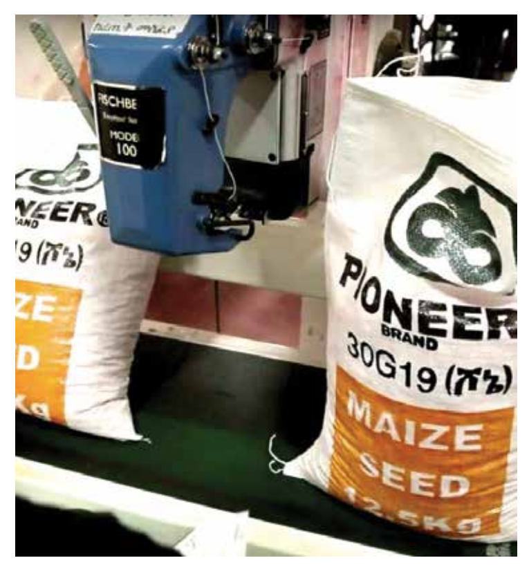
Dupont maize seed in Ethiopia

This strong stance to increase private sector representation suggests a total lack of consideration of farmers, consumers, and the environment. The EBA methodology accords a country a maximum score if all VRC members are from the private sector, even though this raises serious concerns about transparency, independence, and the competence of the authorities presiding over the release of new seed varieties.