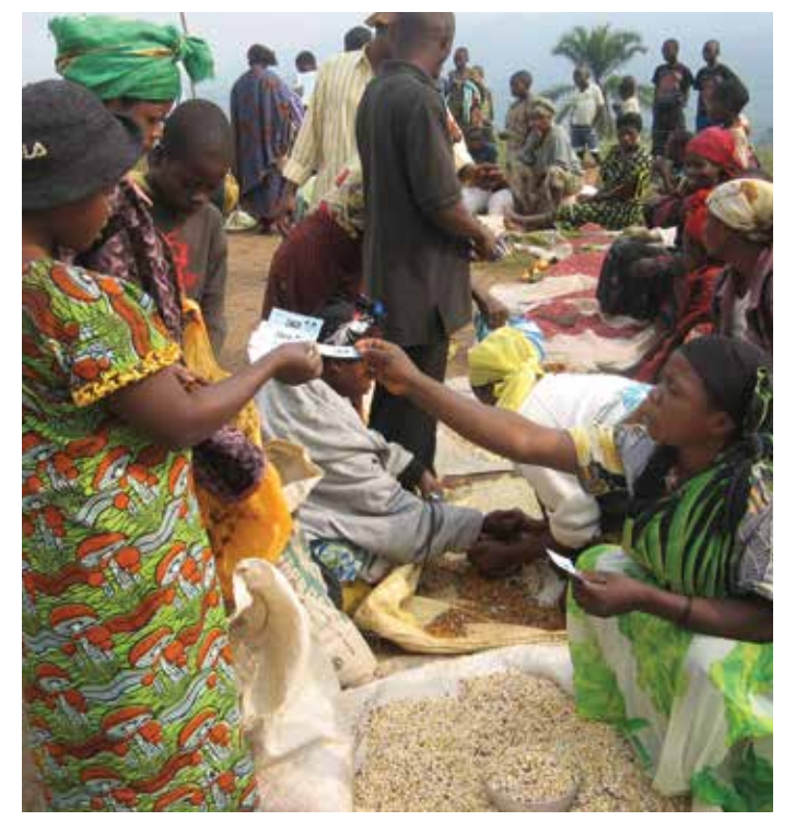
A seed fair in Democratic Republic of Congo

growers specialize in the multiplication, production, and sale of seeds, 126 and circulate seeds through local networks, often reaching remote locations and disseminating valuable information on varieties' properties and planting methods. 127 In Uganda and DRC, two war-stricken countries, the organization of seed fairs attracted numerous vendors and helped restore households' seed stocks, boost the local economy, and improve agricultural productivity. 128 In Zimbabwe, a local seed bank initiative enabled a drought-affected community to save over 6 tons of seed in just four years. The seed bank serves as a buffer in times of individual or community crop failure. 129